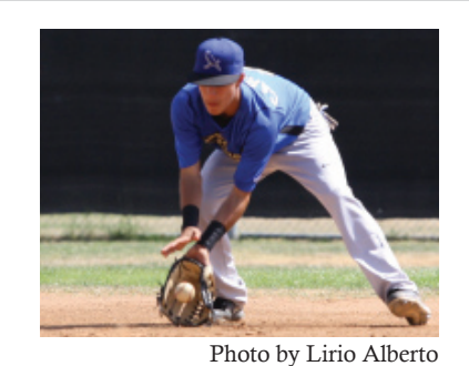
r-o Famou ic